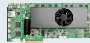
Matrox MaeveX 6100 Quad 4K Encoder Card