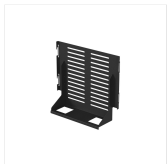
EVER350 Installation shelf 16-106-1