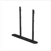
EVER Under display shelf 16-104-1

We reserve the right to introduce changes in the product specifications after the printing and publication of this document.