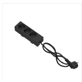
EVER350-620 Power strip EU 16-110-1