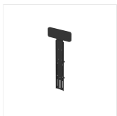
EVER Camera mounting panel 16-105-1