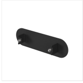
EVER Cable winder 16-108-1