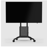
EVER350 Mobile Air Dark Soft Motor 16-008-1S-M