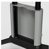
EVER350 Mobile Air Light Clean Motor 16-008-9C-M