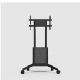
EVER350 Mobile Air Dark Soft 16-007-1S