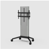
EVER350 Mobile Light Soft 16-004-9S