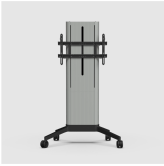
EVER350 Mobile Light Edge 16-004-9E