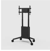
EVER350 Mobile Air Dark Clean Motor 16-008-1C-M