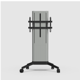
EVER350 Mobile Light Edge Motor 16-005-9E-M