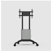
EVER350 Mobile Air Light Clean 16-007-9C