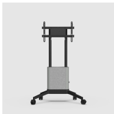
EVER350 Mobile Air Light Soft 16-007-9S