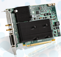
Matrox Mura MPX-SDI