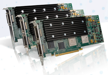
Matrox Mura MPX-4/4, MPX-4/2, MPX-4/0